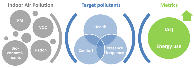
Figure 1: Schematic overview of Subtask 1.

Subtask 1 aims at summarizing the current knowledge on target pollutants for residential buildings and at evaluating indoor air quality (IAQ), i.e. how to define indices that provide useful information allowing to achieve low risks for health in indoor spaces, and how to enable the comparison of solutions for achieving high IAO taking into account energy efficiency. These objectives will be achieved by compiling and analysing previous studies on the subject available in the literature. A first step will consist of determining a list of target pollutants commonly found in residential buildings and by identifying the pollutants that are listed by cognizant authorities as harmful. It will be verified whether they are present in recent low energy residential buildings at the concentrations, which can surpass the recommendations of the different authorities. Additionally, the existing IAO metrics, e.g. [2], will be reviewed to propose the scientifically sound index (or set of indices) for the evaluation of indoor air pollution. Different endpoints will be considered and the metric scheme(s) defined. The last part of this subtask will be dedicated to examining the energy implications of the proposed metric scheme(s) to ensure that there is no unreasonable increase of energy consumption. Figure 1 gives a schematic overview of Subtask 1.